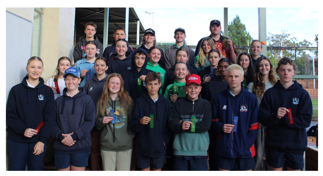
Students are out of school uniform due to a mufti day.