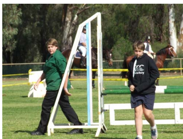
Student helping out as Stewards at the Cobar Show.