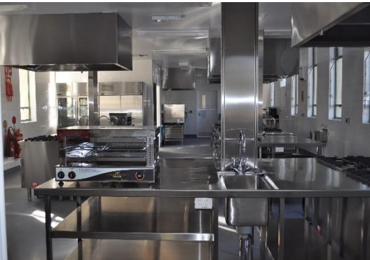
Trade Training Centre- Hospitality Room

Cobar High School actively participates in many local events and our students volunteer in a range of services within the town.