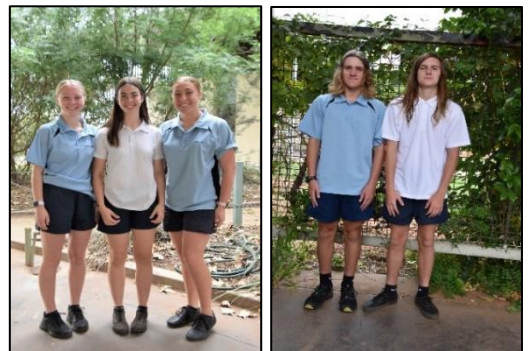
Senior School and Sport / PE uniform (PE shirt has navy shoulder detail)