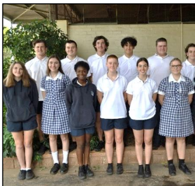
Senior School uniform (dress for juniors also)