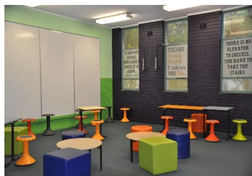
Flexible learning classroom