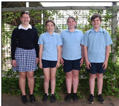
Junior School and Sport / PE uniform (PE shirt has navy shoulder detail)

Denim jeans or shorts, as well as tights are NOT a part of the uniform at Cobar High School.