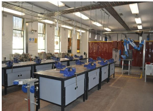
Trade Training Centre- Metal Work Room