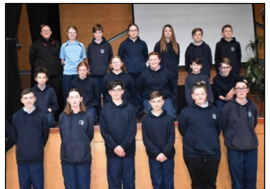
Winter School uniform